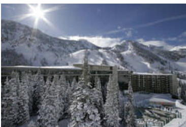
Snowbird, the location for the 2009 US IALE Symposium