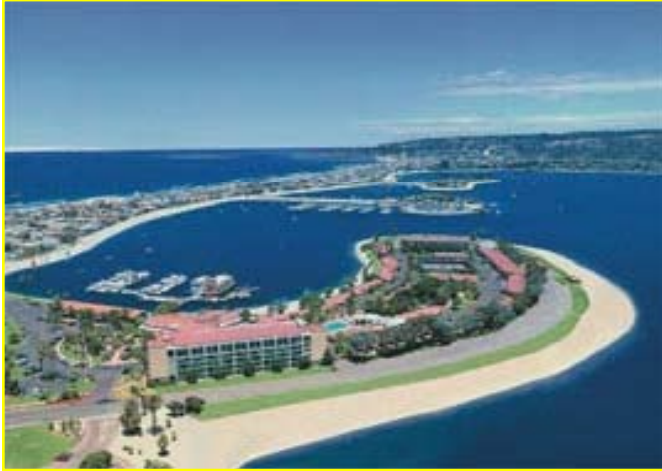
Bahia Resort Hotel, Mission Bay

critical to San Diego and the southern California region and increasingly important worldwide. We have especially tried to bridge the land-water divide in landscape ecology and have structured the program that way.